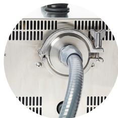
Hose Adaptor Connectors

The 6D can also be used for testing positive pressure systems using an optional hose adaptor. On-site routine maintenance is easy. And its integrated compressor makes implementation simple - all you need is a power source.