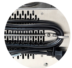
Power Cord Storage