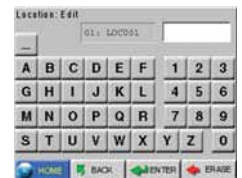
Alphanumeric Location Labels