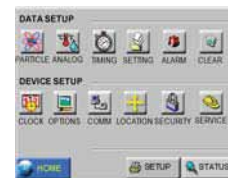
User Friendly Configuration