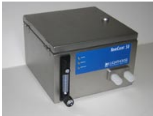
Figure 2 – A DI Water Liquid Particle Counter

Figure 2 below is a DI water counter designed to meet the requirements outlined previously in this section.