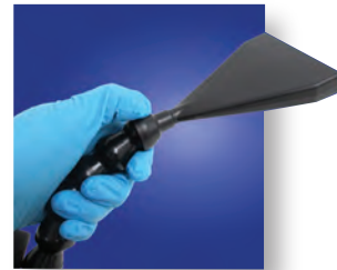
Adjustable Probe Head