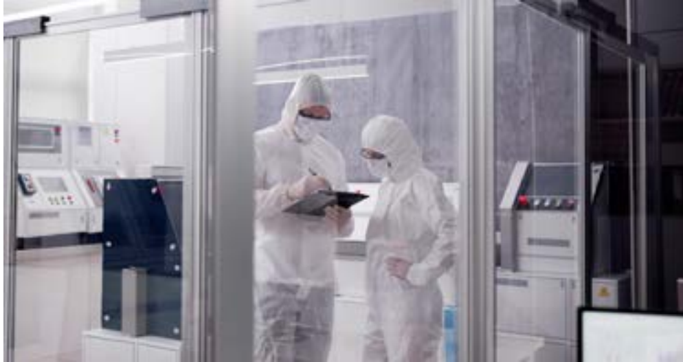
A worker in a cleanroom decontaminating equipment.

Regular and engaging training sessions are vital for ensuring that all personnel adhere to cleanroom protocols. The Forgetting Curve shows that people forget a significant portion of what they learn within days. To combat this, provide regular training that reinforces key concepts and introduces new information. Interactive training methods can improve retention and compliance.