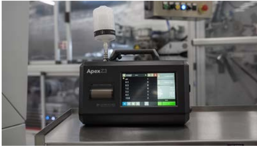
An ApexZ portable particle counter, capable of fully paperless particle counting.