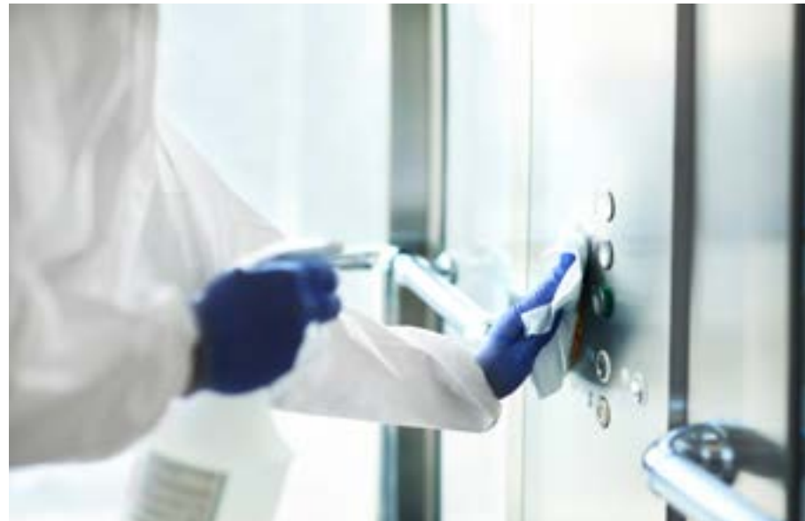
A worker in a cleanroom decontaminating equipment.

Decontamination is a straightforward but essential process. It involves cleaning and sterilizing all items before they enter the cleanroom. On the outside, everything must be decontaminated to prevent the introduction of contaminants. Inside the cleanroom, routine maintenance and cleaning are necessary to manage particles generated within the environment. This includes wiping down surfaces, tools, and equipment regularly.