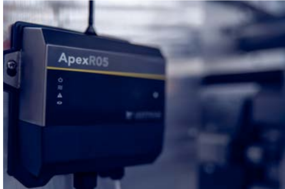
An Apex Remote particle counter mounted with a Smart Bracket.

Particle counters are crucial tools for cleanroom monitoring. They measure the concentration and size distribution of particles in the air, providing valuable data on the cleanliness of the environment. By integrating particle counters with real-time data capabilities, you can proactively monitor and maintain cleanroom efficiency. These sensors can detect even subtle changes in particle levels, alerting operators to potential contamination risks.