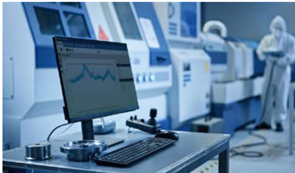
A real-time monitoring terminal within a cleanroom.

To enhance the accuracy and efficiency of your cleanroom monitoring, consider implementing real-time data software. This technology automates data collection and analysis, reducing reliance on manual input and minimizing the risk of transcription errors. Real-time data software ensures that your monitoring systems are always up-to-date, providing you with accurate and actionable information.