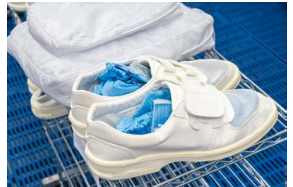
Cleanroom gowning ready to be equipped.