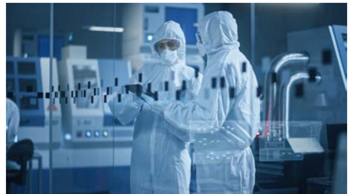
Workers viewing real-time environmental data within a cleanroom.

Regular monitoring is crucial in maintaining the cleanliness of your cleanroom. This involves continuous assessment of airborne particle levels, surface cleanliness, and microbial contamination. Real-time monitoring systems, such as particle counters, provide instant feedback on the particulate levels in your cleanroom. These systems help detect deviations from acceptable cleanliness standards, allowing for immediate corrective actions.