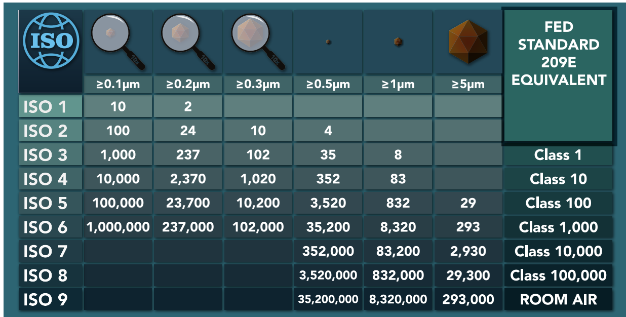
ISO 14644-1:2015 Table

ISO 14644-1:2015 is the most widely used standard and has a look up table to determine the cleanroom cleanliness based on the particle concentration sampled. For example ISO 9 to ISO 1 represents the cleanliness of the cleanroom from less clean to ultra clean. An ISO 1 cleanroom has an extremely low concentration of airborne particles compared to an ISO 9 cleanroom. Therefore certain cleanroom processes and operations are performed based on the product being manufactured and the cleanliness level of the cleanroom. Even in today's operating theatres in hospitals the operating room must maintain a cleanliness level to reduce the risk of the patient from contamination of microbes that could be fatal to them if there were exposed to them during the operating procedure.