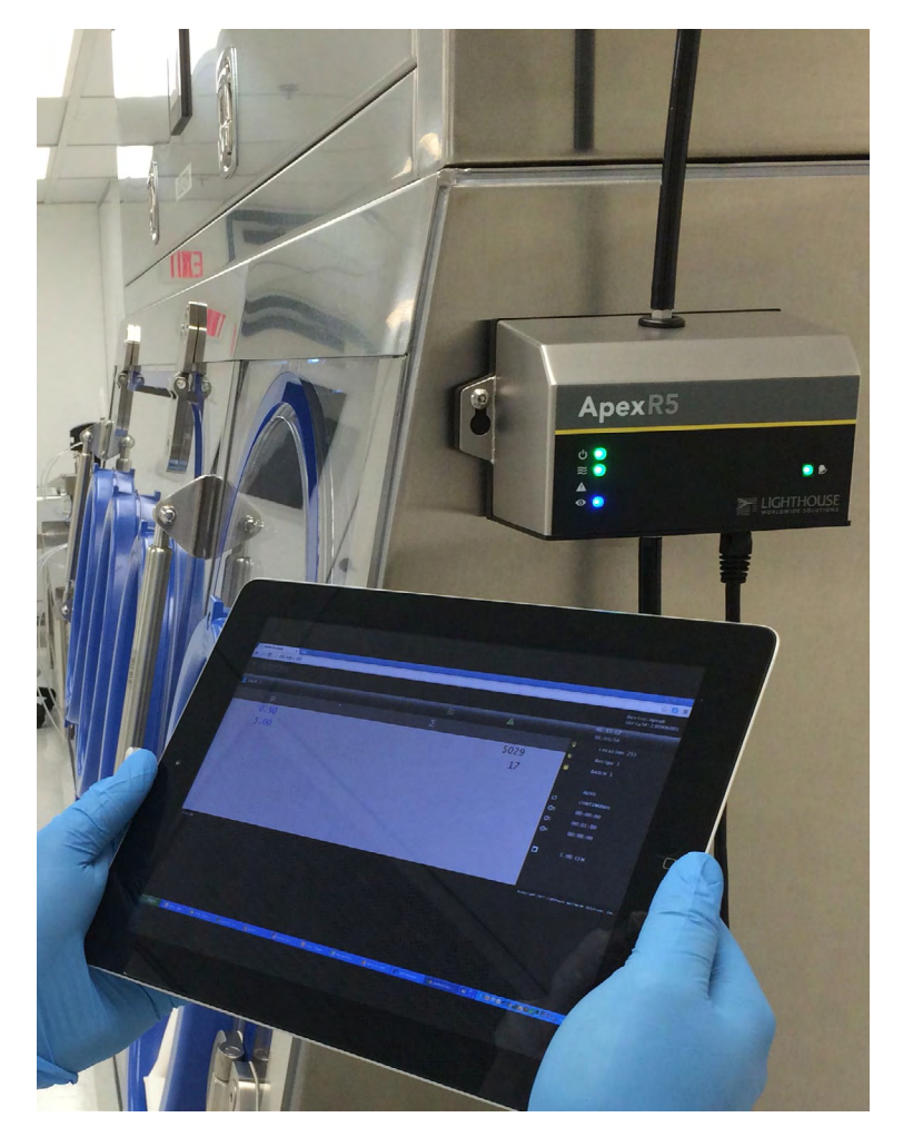
Remote particle sensor continuously monitoring 0.5µm and 5.0µm particle concentrations

Most locations along he filling line are typically, at the entry of vials from the sterilization oven, at the accumulator, near the filling head and stopper/capping location and also at transport locations to a freeze drier and within the transport itself up to the freeze drier. A typical filling line could have 6-7 sample locations and then in conjunction ISO 7 locations are monitored (Background locations inside the room where the filling line is located).