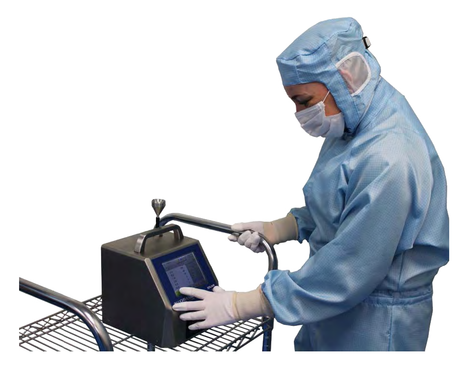
Operator setting up Particle Counter for Cleanroom Certification

Cleanroom Certification is therefore a formula and when applied a determined result is provided based on the accepted limits of allowable particles in a cubic meter sample which are referenced back to the table above in fig 1. With improvements in particle counter instrumentation technology the fastest time to sample a cubic meter is now 10 minutes per location. One portable unit is used for each sample location and the operator manually takes the particle counter to each location after the desired sample volume is reached.